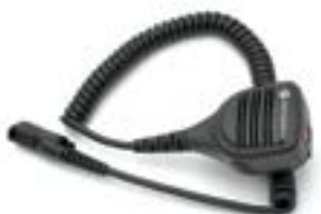
PMMN4078 Small remote speaker microphone with audio jack and emergency button, windporting, IP55.