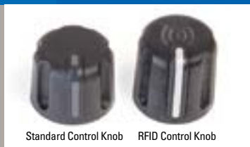
Standard Control Knob RFID Control Knob

◀ Optional colour identification bands for groups with different tasks, coverage areas or shifts