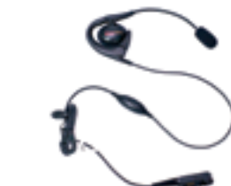
PMLN5732* Mag One lightweight earset with boom microphone and in-line push-to-talk.