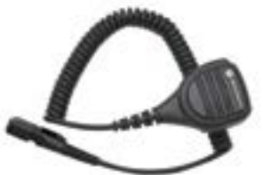
PMMN4075 Small remote speaker microphone, windporting, IP57. No emergency button.