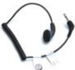
AARLN4885 Receive-only covered earbud with coiled cord for RSM.