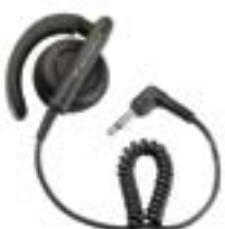
WADN4190 Receive-only flexible earpiece for RSM.