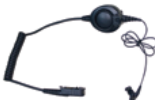
PMLN5729 IMPRES Bone Conduction Ear Microphone with in-line large push-to-talk with protective ring. Transmit in noisy environments using bone conduction.