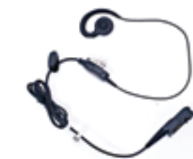
PMLN5727 Mag One swivel earpiece with in-line microphone and push-to-talk.