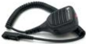
PMMN4072 IMPRES large remote speaker microphone with noise-canceling microphone, louder audio, audio jack and emergency button, IP54.

Get the most out of your MTP3000 Series radios by extending its power and reliability with Motorola certified accessories. This includes select 3rd party accessories that have been tested and certified with the MTP3000 Series radios. Our accessories endure rigorous testing to help keep you safer.