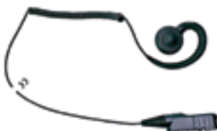
PMLN5728 Mag One Earbud with in-line microphone and push-to-talk button.