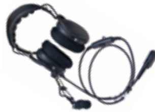
PMLN5731* Dual-muff over the head headset with boom microphone and in-line push-to-talk, 24dB noise reduction rating.