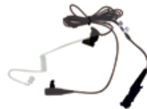
PMLN5724* 2-wire surveillance kit with quick disconnect acoustic tube, black. (also available in beige PMLN5726)